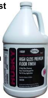
High Gloss Floor Finish CB-1020G