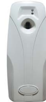
Air Fragrance Dispenser FR-MACAB