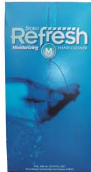
Moisturizing Foam Hand Cleaner STO-ST550095