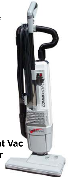
EP-TN16 16" Upright Vac Dual Motor