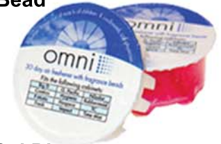
Omni Gel Dispenser FR-RCAB