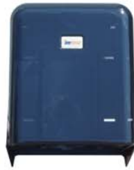
Hand Towel Dispenser OS-93728