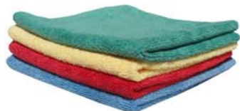
Electromagnetically-Charged Microfibers Attract & Hold Dust & Grime GS-IMFC603636