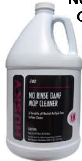
No Rinse Damp Mop Cleaner CB-702