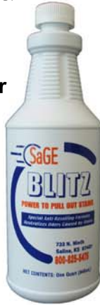
Stain Remover & Odor Neutralizer AL-716