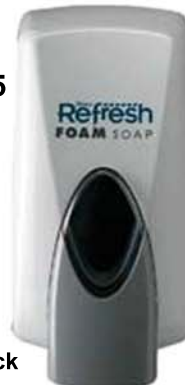
Also In Black Foam Soap Disp. STO-ST30290