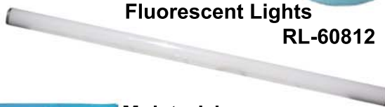
Fluorescent Lights RL-60812